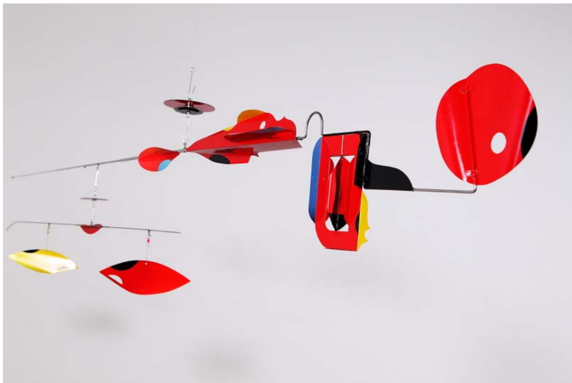
Tay Chee Toh, Exploration , 2010, Stainless Steel, Aluminum, Acrylic, automobile paint, H63 x D340cm