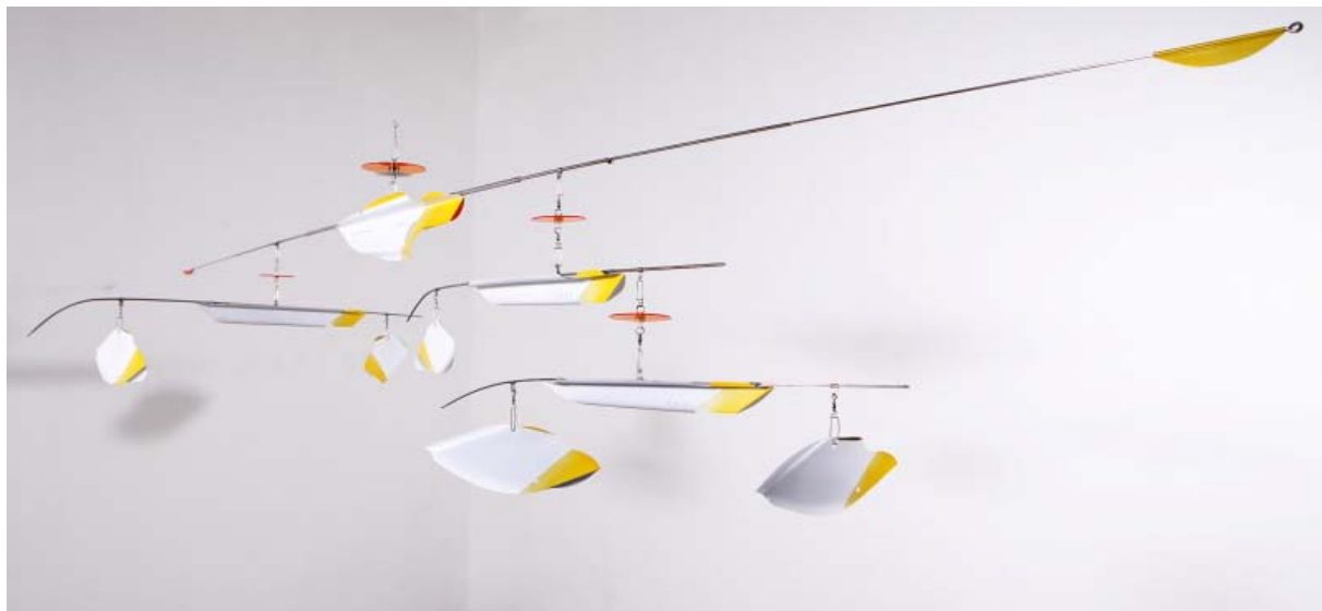
Tay Chee Toh, Take Flight , 2010, Stainless Steel, Aluminum, Acrylic, automobile paint, H63 x D340cm