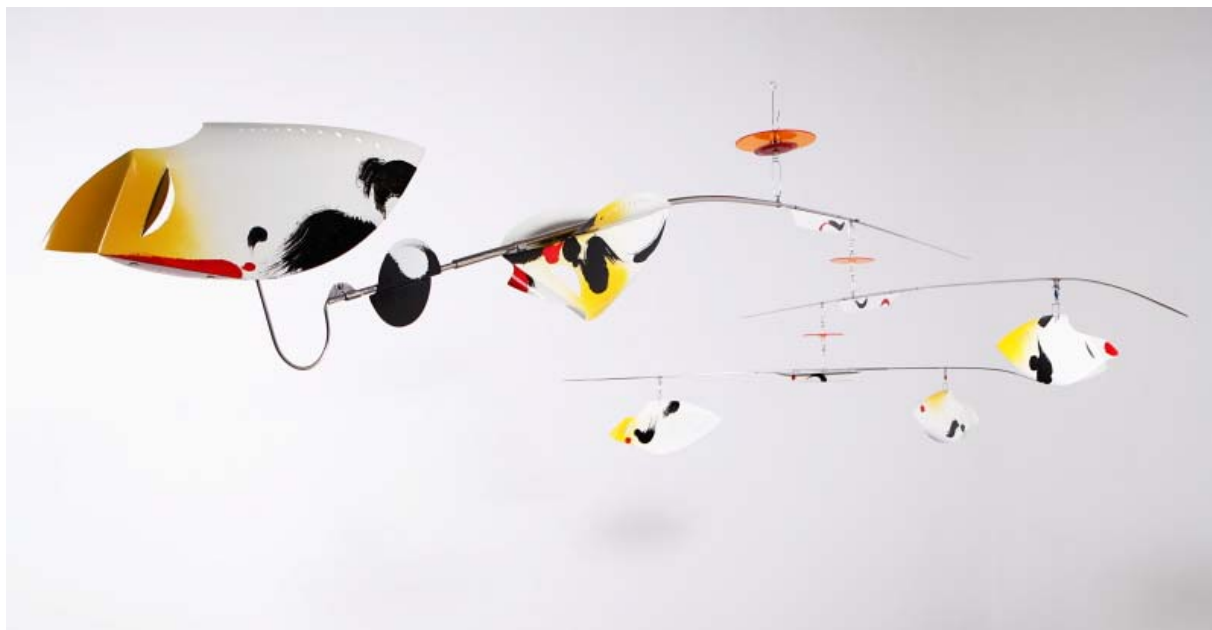
Tay Chee Toh, New Dawn II , 2010, Stainless Steel, Aluminum, Acrylic, automobile paint, H63 x D340cm